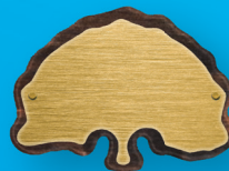
Mini Tree $5000

Since Biblical times, The Tree of Life stood for growth, nourishment and all that is good in our lives. What could be more fitting than a special event that merits lasting remembrance. Our Tree of life offers you this special opportunity to perpetuate the memory of those special moments.